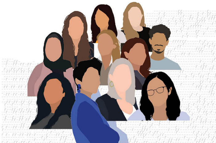
One of the 12 design companies on our shortlist is ROAR